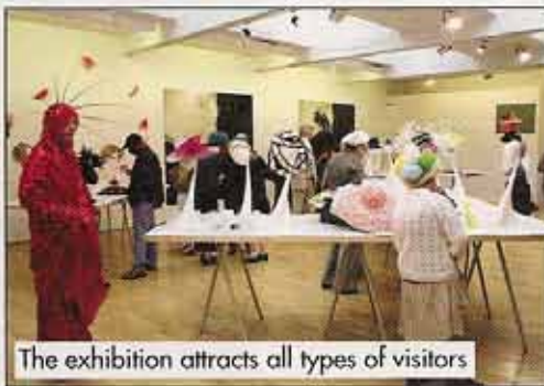
The exhibition attracts all types of visitors