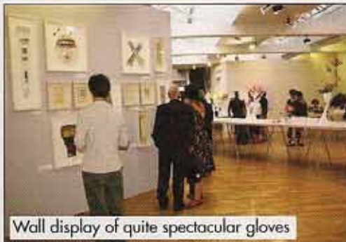
Wall display of quite spectacular gloves